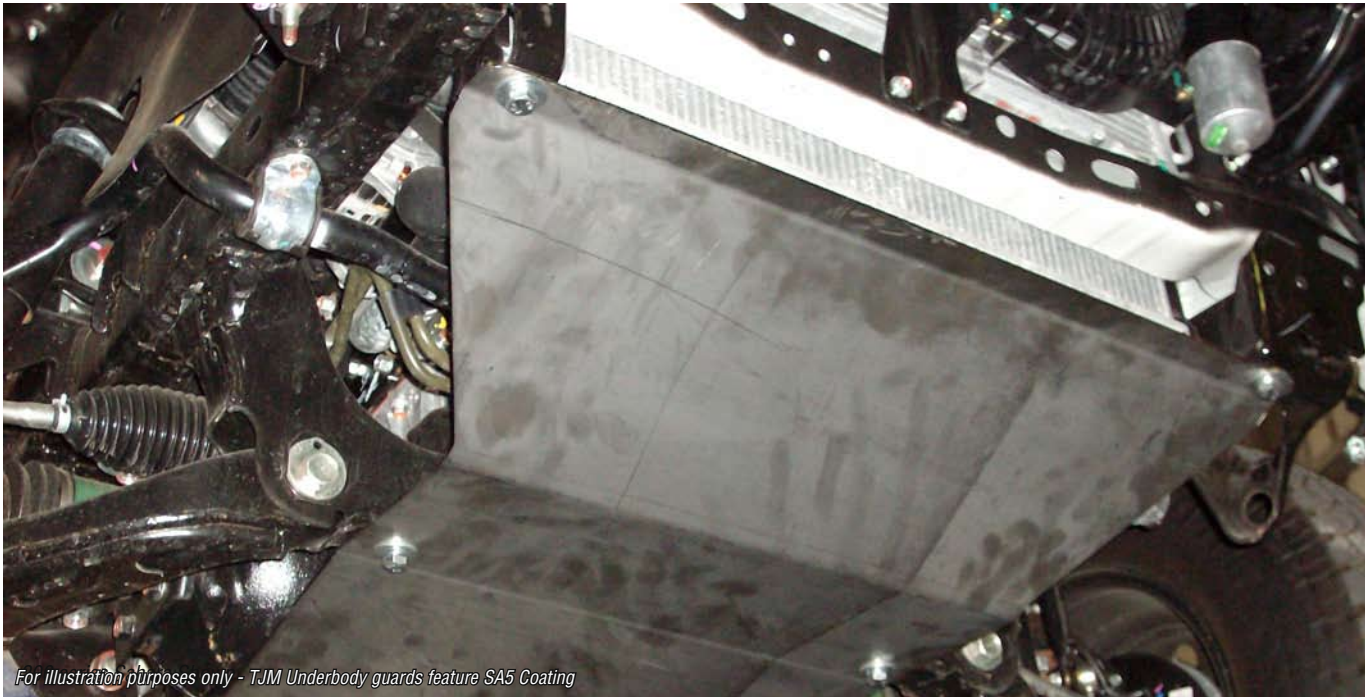
For illustration purposes only - TJM Underbody guards feature SA5 Coating